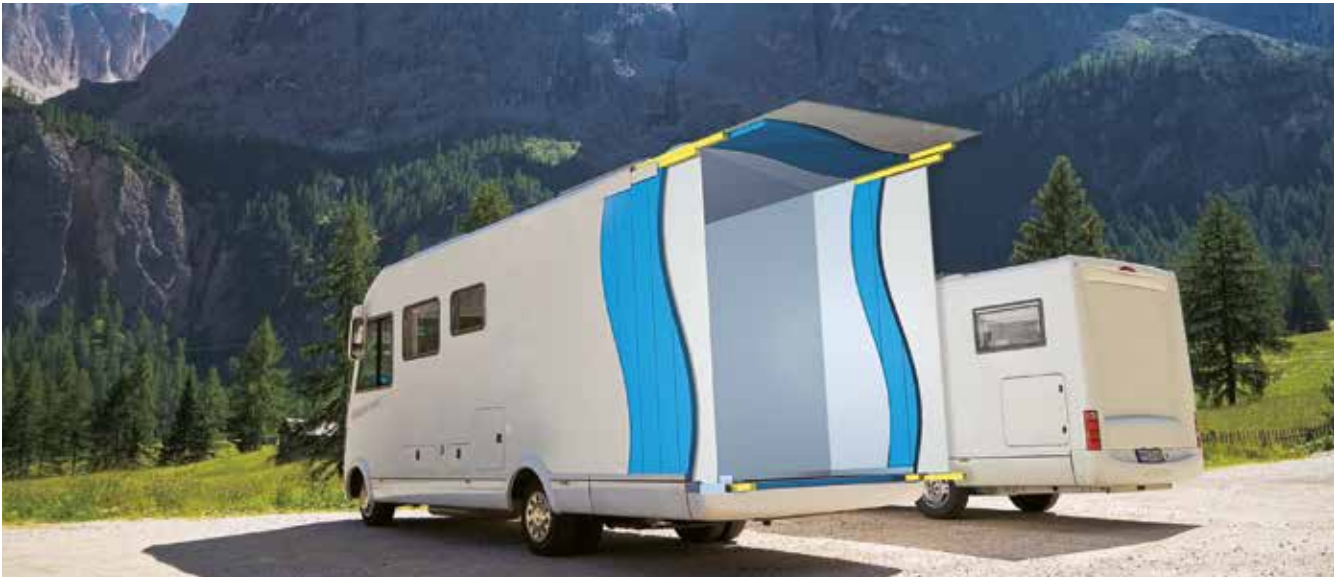
motorhome section (wall and roof simplified view illustrating the use of RAVATHERM™ XPS)

Buying a motorhome or caravan is a major investment decision for any family.