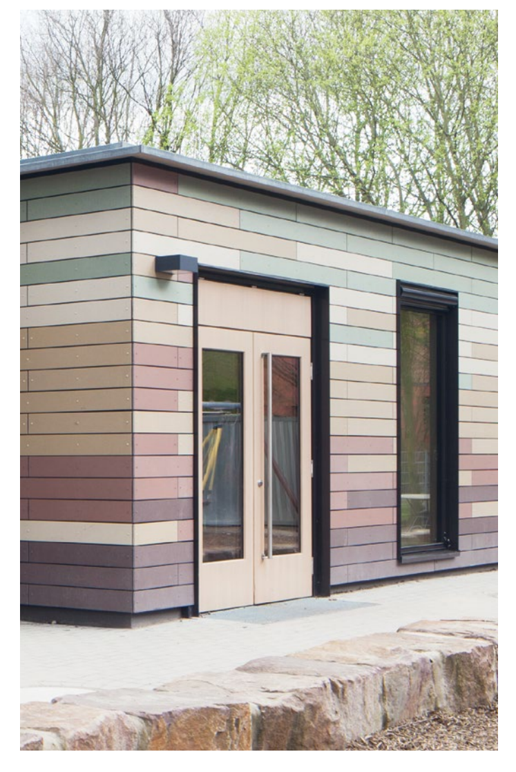
öko skin Characteristics 05/2016