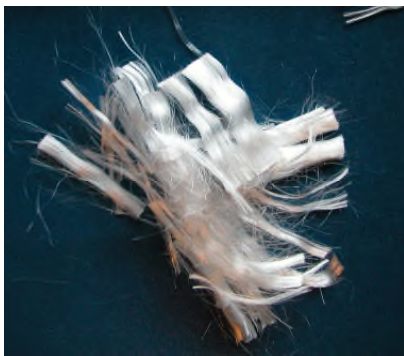
Synthetic micro-fibers MasterFiber 012

The distribution of the fibers inside the matrix occurs in the initial phase of mixing the flakes are dispersed uniformly in the cement matrix. Then the mix water dissolves the water soluble glue and the fibers are separated from the flakes and uniformly dispersed.